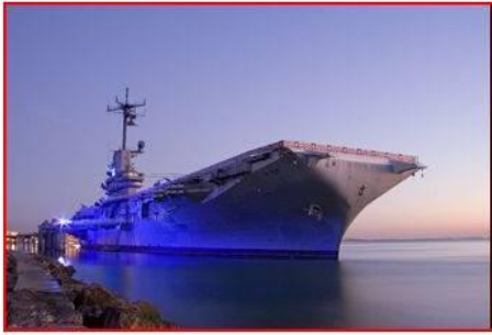
USS Lexington, Corpus Christi